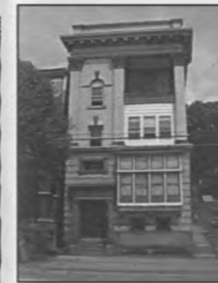
#3 Seybold Apartments 814 Main St

An easy way to see Old Town Wheeling is to walk north from the I-70 expressway along the east side of Main Street. Examine the details of the homes on the side you are walking and look across the street at the full facades of these places. As you walk, look at all the houses, not just the ones described here, for each has trim or design features to enjoy. At 6th Street, cross over to the west side of Main Street, walk south, and then back toward the expressway to find restaurants for a drink or meal.