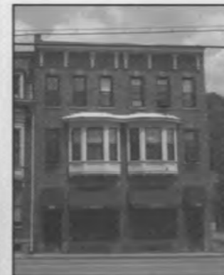
#1 Sauter Apartments 836-838 Main St