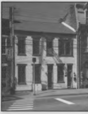
#15 Phillips House 653 Main St