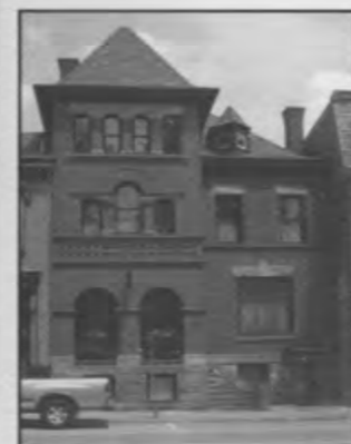
#2 Spragg House 832 Main St

This eclectic apartment building built in the 1880s for A. Johnson, has distinctive golden colored bricks that glow in the afternoon sun. There are many lovely architectural features including the metal finials at the roofline, arched windows of the top story, bay windows and spacious porches. The third floor cornice has modillions, egg and dart and Greek key trim. Be sure and look for the filigree-like terracotta molding at eyelevel.