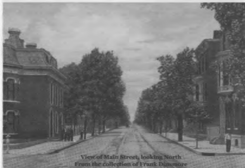
View of Main Street, looking North

Spectacular stained glass windows highlight the lower level of this twin townhouse, one of the most beautiful buildings in Victorian Wheeling. Built in the 1890s for Joseph Hedges and H. Meyer, the eclectic houses are distinguished by sandstone arches, corbeled brick and classic triangular pediments over extended oriel windows. Metal finials and a parapet distinguish the roofline of this fabulous building.