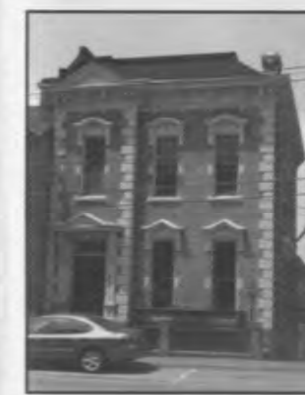
#24 Hess House 811 Main St

The 800 block was a fashionable area in the 1890s where many of Wheeling's successful businessmen built stately homes. This one was built for George Stifel, who owned one of the largest dry goods stores in Wheeling. Later, famous Wheeling photographer George Kossuth lived here. The mansard roof has curved corners of ogee design, complimented by 3 dormer windows.