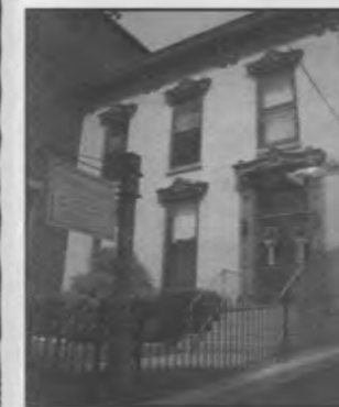
#5 Sweeney-Winter House 742 Main St