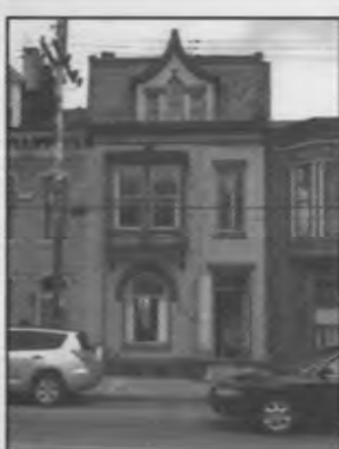
#13 Phillips-Robertson House 645 Main St

Beautifully incised, green and gold decorated stone lintels are found above each window and door. The same motif in wood occurs above the oriel bay window on the second floor and along the cornice. The house was built circa 1894. The stained glass upper sash in the first floor window dominates that floor and can be viewed from the sidewalk.