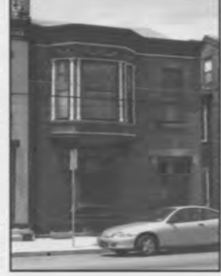
#12 643 Main St

Built circa 1890, the 3-story, Queen Anne duplex has a distinctive brick façade with sandstone details. The house boasts a slate, cross-gabled roof, a stone foundation and a fabulous view of the waterfront. Both sides have identical second-story oriels and charming recessed entryways.