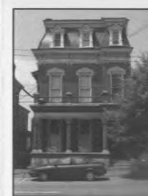
#23 Stifel-Kossuth House 807 Main St

Built in the 1850s as the Waterworks Inn and named for the nearby city water facility, this building was modified in the 1870s when 753 and adjacent buildings were bought and combined by Alfred Caldwell, an attorney in a prominent pioneering Wheeling family. A hexagonal tower and mansard roof were added about the time of the building's consolidation. It is currently the home of Uncle Pete's, a popular restaurant.