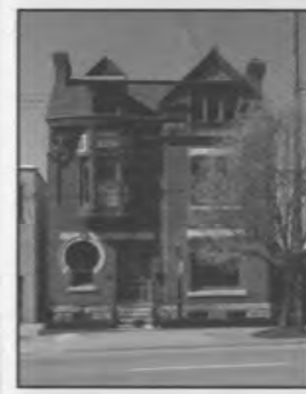
#20 Alfred Paull House 729 Main St