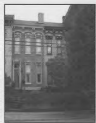
#8 Williams Tenement 730-732 Main St

This tenement house was built in the Italianate style for C.L. Williams. It is a perfect example of middle class housing during the 1880s. The hoods and pediments over the windows and doors are adorned with Eastlake detailing. The continuous cornice stretches across both houses and has matching brackets and details, with only the paint colors delineating the separate sides.