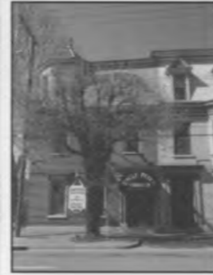
#22 Caldwell House/Waterworks Inn 753 Main St

This Italianate style house was built in the 1860s. Several wonderful features include a stained glass window from Sacred Heart Church, the kitchen and great room with tin ceiling and old brick fireplace, and spectacular views of the Ohio River. The present owners purchased the house next door for additional space — including a North Wheeling rarity — a parking garage!