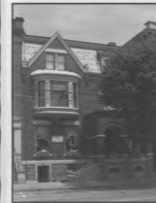
#4 Echhart House 810 Main St

As the only white facade in North Wheeling, the Seybold apartment building stands out for its hue as well as for its classical design. Built in the classical revival style, the large Corinthian pilasters with ornate capitals support a massive cornice with egg and dart trim. A brick parapet sits atop a projecting cornice. All the original design elements are regal but subsequent changes have added mass to a once open corner.