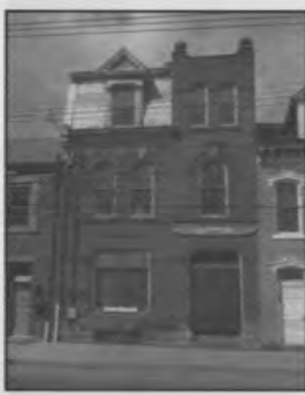
#14 McCusky House 651 Main St