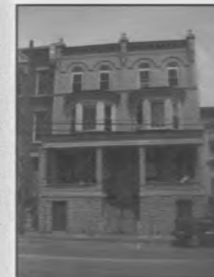
#6 Johnson Apartments 738-740 Main St