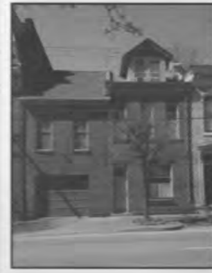
#21 741 Main St