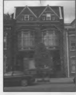
#11 Roberts House 623 Main St

Named for a founder of Wheeling, the history of this attractive building is undocumented. This is a beautiful building with a projecting cornice and bold brackets, two-story oriel windows and three levels of ornamental balconies and doors. The details of this house are Italian Renaissance Revival with a colorful flair. There are six, two bedroom units in this 3-story rental structure.