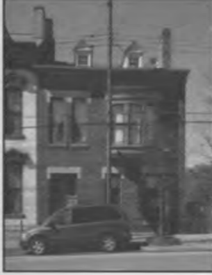
#17 Mozier's Tavern 711 Main St