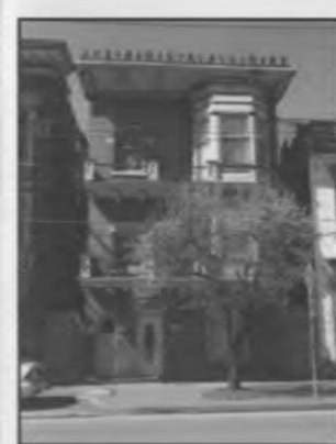
#18 Morris Apartments 717 Main St

The front of this house with its curved oriel bay window, elegant stone window lintels, and stylistic cornice suggests a late Victorian construction. The north wall of the house, as seen from the driveway, shows that a new front was added, probably in the 1880s, to the earlier structure. Frederick Mozier owned and operated a tavern in this house during the 1850s.