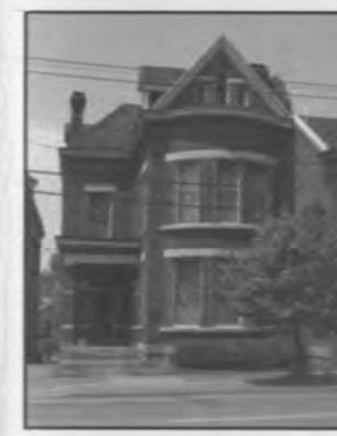
#25 John List House 821 Main St