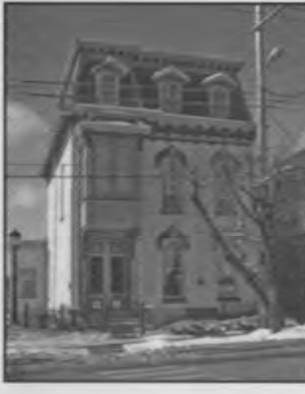
#16 William Goering House 701 Main St