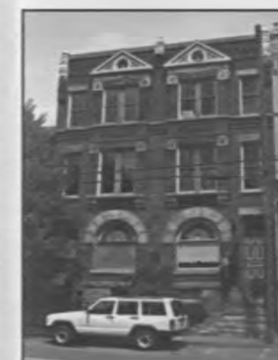
#7 Hedges-Meyer House 734-736 Main St