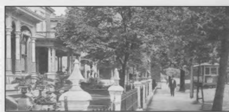
View on Main Street Wheeling, W. Va.