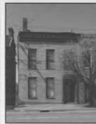
#19 Mathison House 727 Main St

Like 604 Main, this building is dominated by its projecting cornice and topped with decorative metal cutouts of what appear to be pineapples! The top 2 floors on the right have bay windows balanced with small balconies surrounded by metal railings on the left. The narrow, round-topped door at bottom left may have been a servant's entrance if this ca. 1900 building was originally a single-family home.