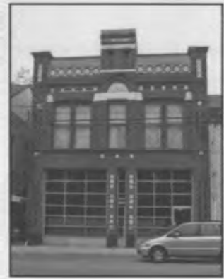
#9 Vigilant Firehouse 648-650 Main St

This tenement house was built in the Italianate style for C.L. Williams. It is a perfect example of middle class housing during the 1880s. The hoods and pediments over the windows and doors are adorned with Eastlake detailing. The continuous cornice stretches across both houses and has matching brackets and details, with only the paint colors delineating the separate sides.